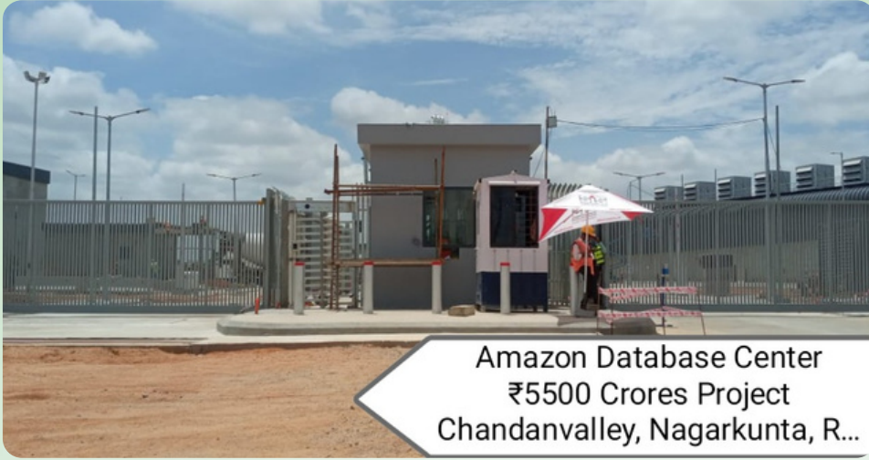
Amazon Database Center ₹5500 Crores Project Chandanvalley, Nagarkunta, R...